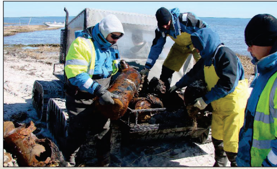
A USACE Remedial Investigation team removes Jet-Assisted Takeoff rockets from Plum Tree Island Range.

Plum Tree Island National Wildlife Refuge is located 11.2 miles east of Newport News and includes the largest portion of the Plum Tree Island Range.