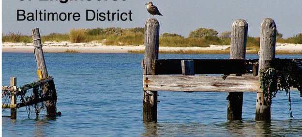
Plum Tree Island provides habitat for many species.

US Army Corps of Engineers® Baltimore District