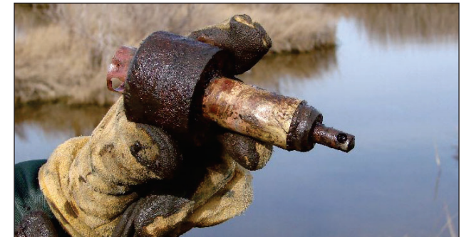
U.S. Army Corps of Engineers Remedial Investigation team removes a World War I MK-I fuze from Plum Tree Island Range.

Unexploded ordnance can look like everyday items such as soda cans, golf balls, or other safe objects. Never take a chance. If you see an item that cannot be easily identified, leave the area and notify someone. If you are unsure what an object might be, don't pick it up.